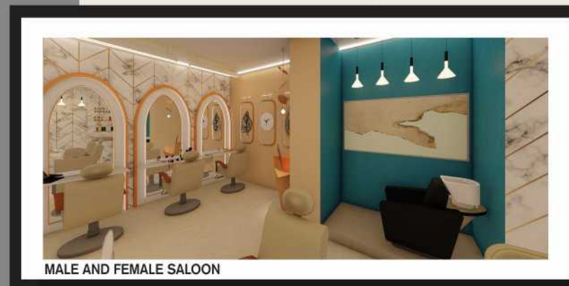
MALE AND FEMALE SALOON